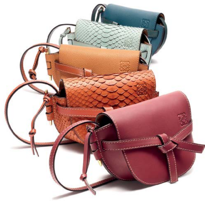
Mini Gate Bags in Calf and Matte Python, 2018