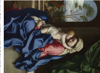
Hans Holbein the Younger, Child holding pearl , 1502-03, The National Gallery, London.

Frieze Sculpture family walk. Frieze Sculpture family walk. Frieze Sculpture family walk. Frieze Sculpture family walk.