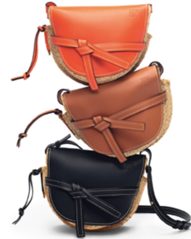
Gate Bags, 2019