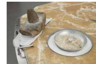
Elaine Cameron-Weir task-dependent conditional displays of camouflage dominated by high-copy repetitive sequences, told to (2016)

Jon Rafman has transformed a gallery stand into a secret movie theater, where visitors can watch, and be watched while watching, a video series fusing amateur 3D animation and niche genres of computer-generated erotica.