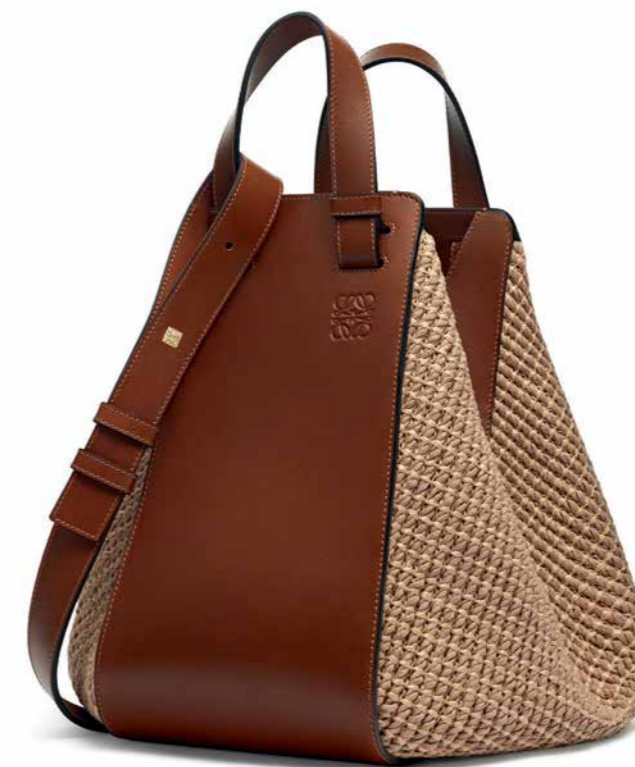
Raffia and Tan Calf Hammock Bag, 2017